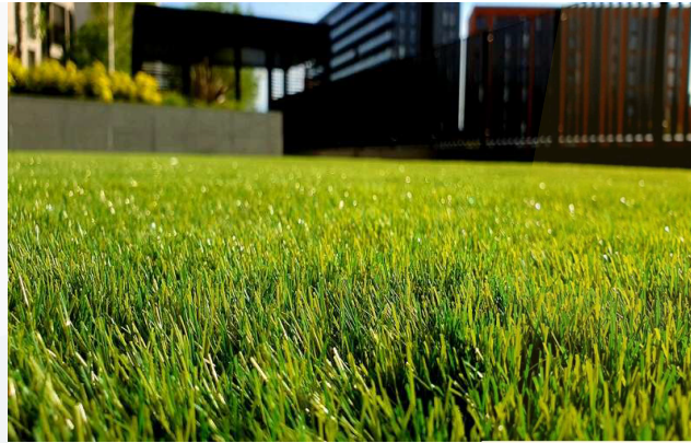
Landscaping & Water Features