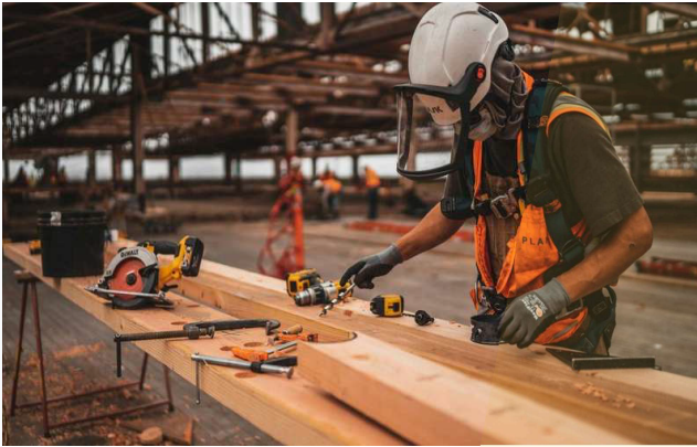
Steel Fixing & Concrete Works